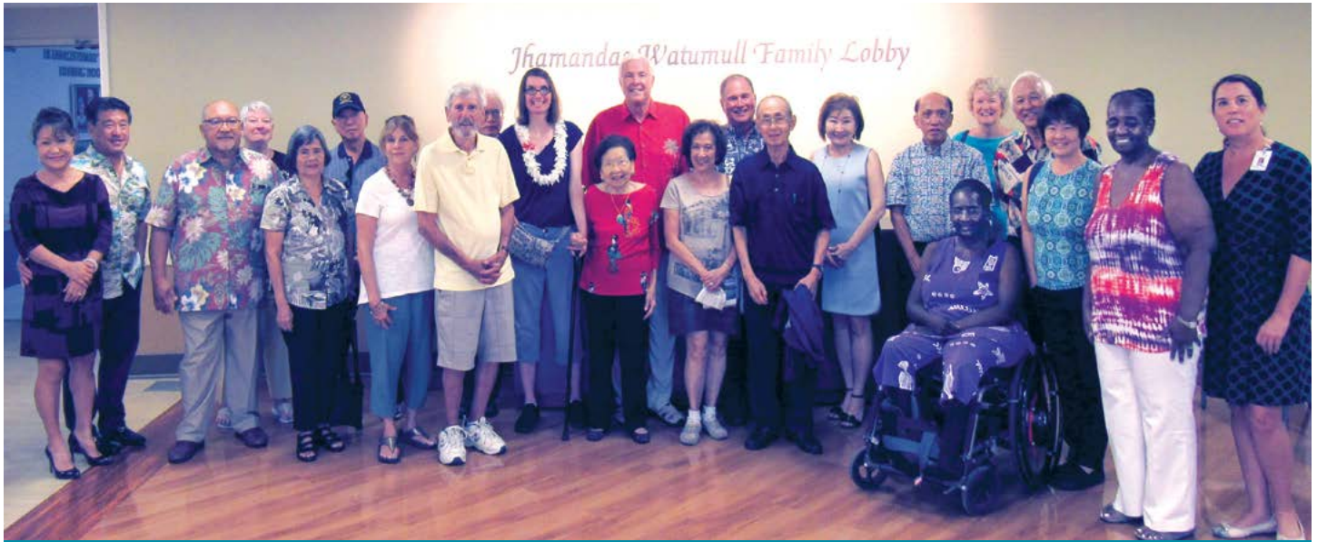
Guests to our most recent Donor Appreciation Luncheon July 24, 2018.