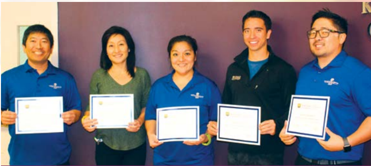
REHAB is certified by the University of Northern Colorado Cancer Rehabilitation Institute as the only sister-site able to offer Clinical Cancer Exercise Specialist Training to any allied health professionals.