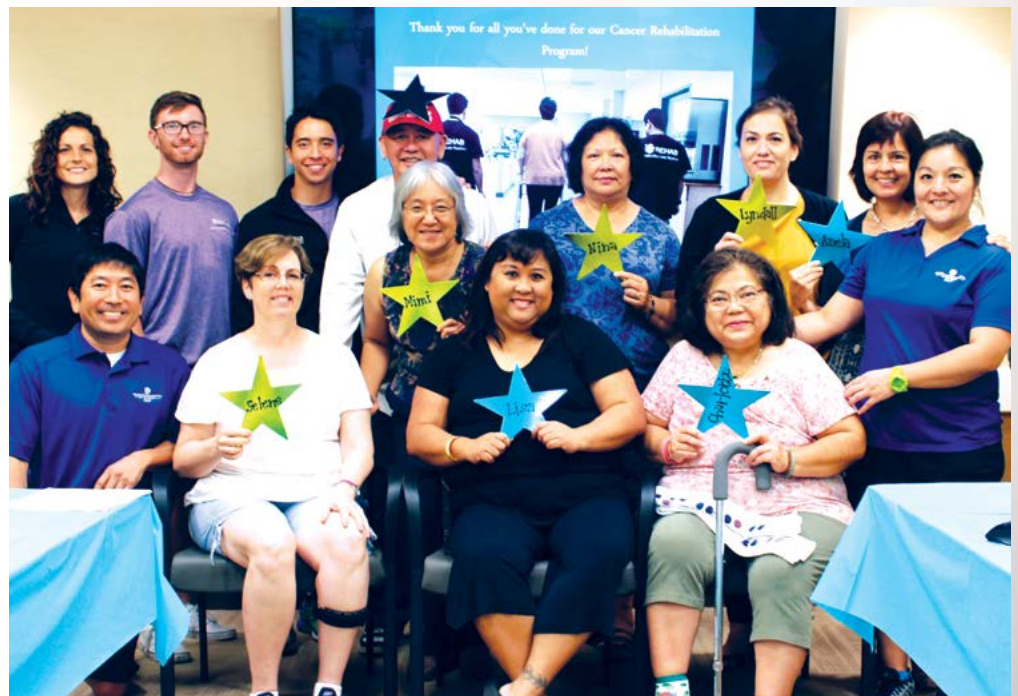
Since the program launched in October 2016, a total of 51 participants have already completed the iCARE program. REHAB currently has 11 participants this summer, with 29 enrolled for the Fall session.