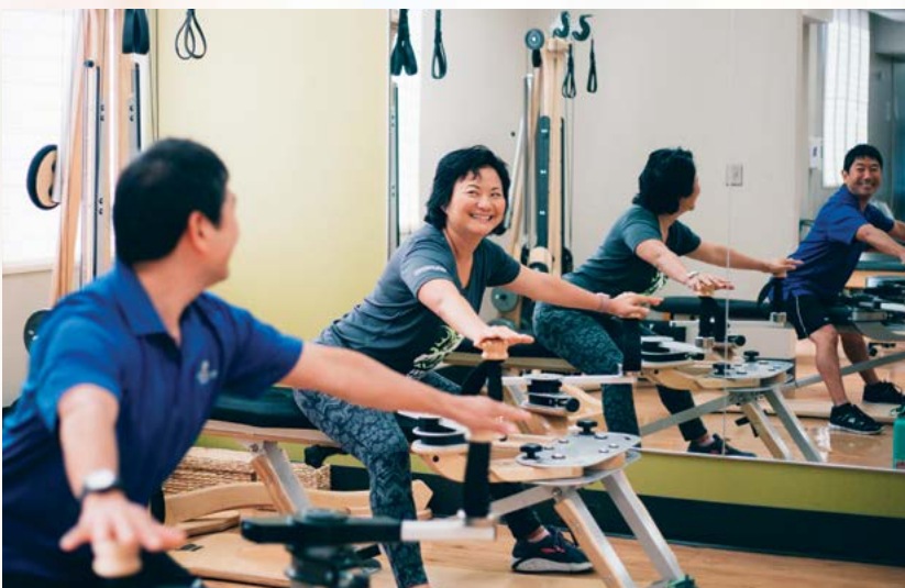
REHAB staff, certified as GYROTONIC® instructors, guide patients through rhythmic exercise sequences to build flexibility, spinal range of motion and core strength.

“REHAB Hospital is the first Cancer Rehabilitation Program to have been