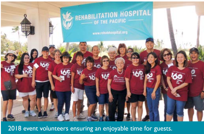
2018 event volunteers ensuring an enjoyable time for guests.

Order NOW for November 2018 delivery. A portion of sales support the REHAB Creative Arts Program. Purchase online https://rehabhospital.ejoinme.org/calendar or call REHAB Foundation (808) 566-3451.